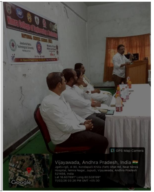
Vijayawada, Andhra Pradesh, India Jg45+rg5, 4-90, Kondapalli Khilla (fort) Ghat Rd, Near Nimra Hospital, Nimra Nagar, Jupudi, Vijayawada, Andhra Pradesh 521456, India Lat 16.607691° Long 80.508199° 11/02/26 03:26 PM GMT +05:30