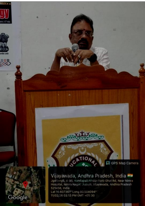
Vijayawada, Andhra Pradesh, India Jg45+rg5, 4-90, Kondapalli Khilla (fort) Ghat Rd, Near Nimra Hospital, Nimra Nagar, Jupudi, Vijayawada, Andhra Pradesh 521456, India Lat 16.607361° Long 80.508094° 11/02/26 03:13 PM GMT +05:30