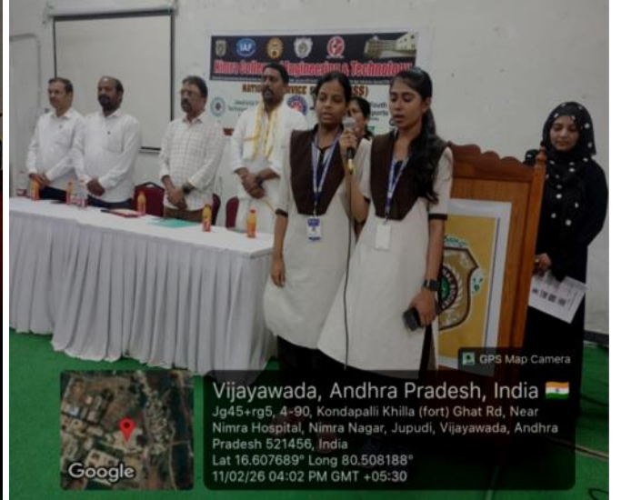
Vijayawada, Andhra Pradesh, India Jg45+rg5, 4-90, Kondapalli Khilla (fort) Ghat Rd, Near Nimra Hospital, Nimra Nagar, Jupudi, Vijayawada, Andhra Pradesh 521456, India Lat 16.607689° Long 80.508188° 11/02/26 04:02 PM GMT +05:30