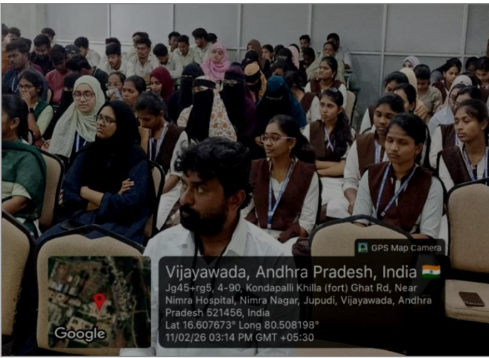
Vijayawada, Andhra Pradesh, India Jg45+rg5, 4-90, Kondapalli Khilla (fort) Ghat Rd, Near Nimra Hospital, Nimra Nagar, Jupudi, Vijayawada, Andhra Pradesh 521456, India Lat 16.607673° Long 80.508198° 11/02/26 03:14 PM GMT +05:30