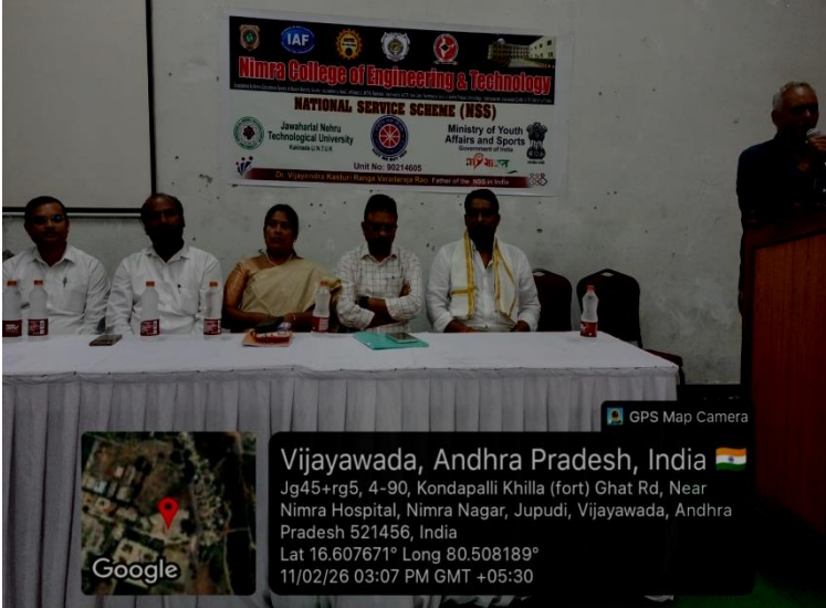
Vijayawada, Andhra Pradesh, India Jg45+rg5, 4-90, Kondapalli Khilla (fort) Ghat Rd, Near Nimra Hospital, Nimra Nagar, Jupudi, Vijayawada, Andhra Pradesh 521456, India Lat 16.607671° Long 80.508189° 11/02/26 03:07 PM GMT +05:30