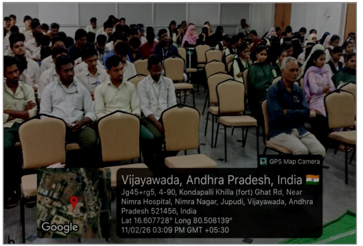
Vijayawada, Andhra Pradesh, India Jg45+rg5, 4-90, Kondapalli Khilla (fort) Ghat Rd, Near Nimra Hospital, Nimra Nagar, Jupudi, Vijayawada, Andhra Pradesh 521456, India Lat 16.607728° Long 80.508139° 11/02/26 03:09 PM GMT +05:30